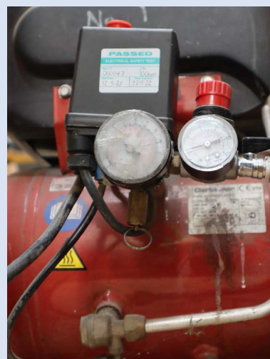
Safety relief valve

Another reason compressors don't always work is that sometimes the operator will turn off the compressor when the receiver tank is still fully charged. Sometime later, they plug it in and nothing happens! Remember that the compressor will only start recharging when the receiver is empty. To discharge the receiver there is a safety relief valve, usually a brass cylinder with a ring. Simply pull the ring until the sound of air escaping diminishes. The motor will then start and replenish the receiver.