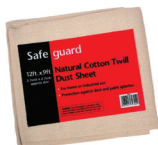
Cotton Dust Sheet