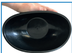
Both bowls are highly flexible

These useful re-useable mixing bowls are ideal for mixing fillers and small quantities of textures. Hardened fillers can be cracked out. Available in two sizes.