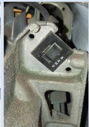
And in close-up

If the system keeps cutting out it is often a sign that the machine needs more oil. Again, refer to the manual for how to undertake this task on your compressor. New compressors are frequently supplied with little oil in them. This is to prevent oil spillage during transit. Additional compressor oil is available from Flints.