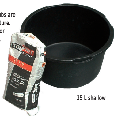
35 L shallow

These multipurpose highly flexible tubs are ideal for mixing large batches of texture. Available as 35 litre shallow version or deep versions to take 42 or 75 litres.