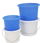
Paint Kettle Liners